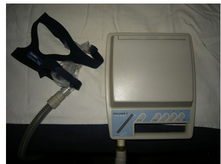
The Sullivan V Plus, a typical mid-1990s CPAP (the mask is more modern).