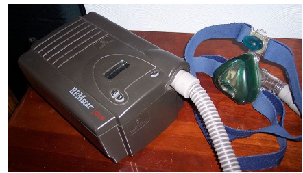
A typical CPAP machine houses the air pump in a case lined with sound-absorbing material for quieter operation. A hose carries the pressurized air to a face mask or nasal pillow.

The CPAP machine blows air at a prescribed pressure (also called the titrated pressure). The necessary pressure is usually determined by a sleep physician after review of a study supervised by a sleep technician