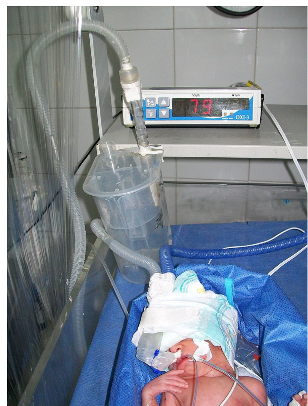
CPAP flow generator in the back to the left, connected to a 1500 gram preterm newborn by a hose and kept in place on the patient with an improvised interface: a diaper.