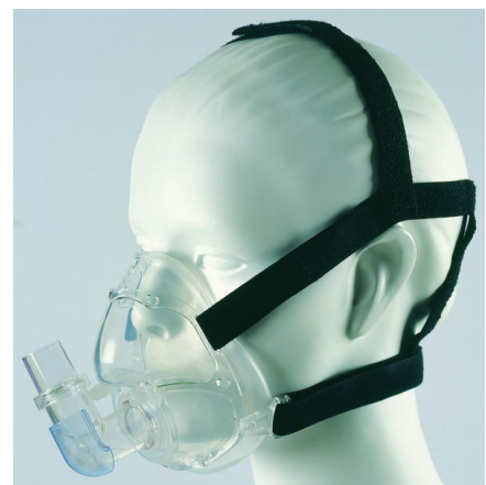
A typical full face CPAP mask.