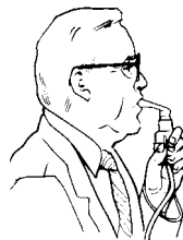
FIGURE 2.2 Using the Nebulizer